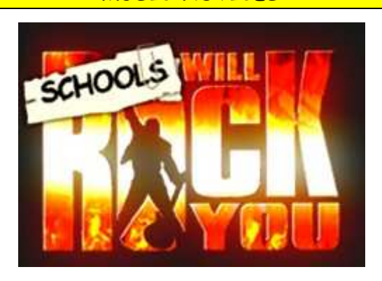
We Will Rock You Lead Rehearsals